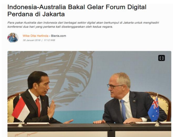
Figure 3. The President Joko Widodo in His Meeting with the Australian Prime Minister Malcom Turnbull in the Signing of the Jakarta Concord at the 2017 Indian Ocean Rim Association (IORA) Summit

In the context of Indonesian, the existence of digital forums in the digital citizenship infrastructure to reinforce national identity is an instrument to contribute for world relations. The following is a figure of President Joko Widodo in his meeting with Australian Prime Minister Malcom Turnbull.